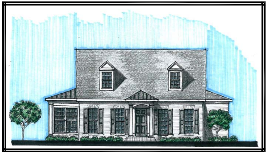
"CAIN MANOR" "COTTAGE STYLE"